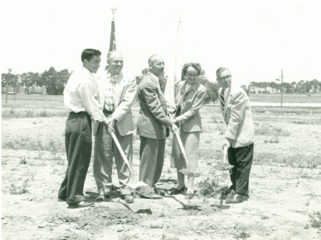
Breaking Ground -- May 22, 1957