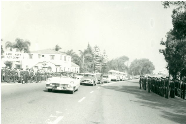
Entering Carlsbad Parade

On February 17, 1958, Carlsbad High students left Oceanside High amidst grand fanfare. A parade of buses and cars wove their way from Oceanside to the Carlsbad border, led by the Oceanside Police who assumed parade leadership, touring the students past the Army Navy School.