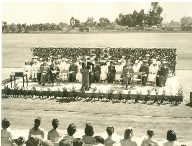
First Graduating Class - June 1958