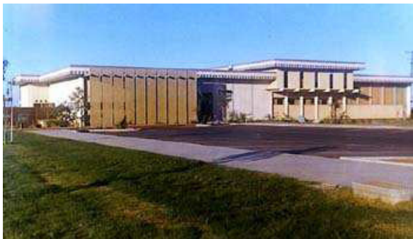
The new Library, Carlsbad's very own "Taj Mahal"