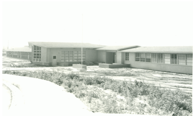
Carlsbad High -- February 1958

help, so please consider spending a few hours helping out. The year- long celebration will culminate with a dinner dance for all Carlsbad High Alumni on Friday night and an open house on Saturday. So help us make this a special recognition of Carlsbad High history and participate in some of the activities.