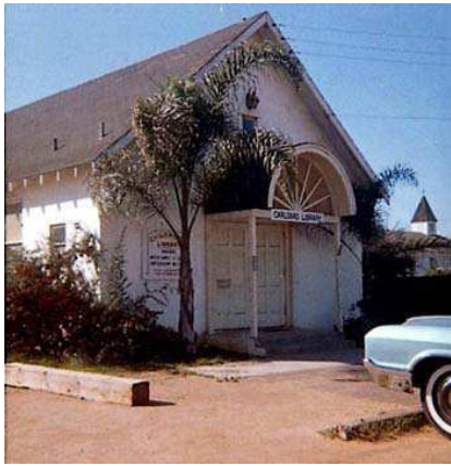
Carlsbad's first library located in the old St. Patrick's Church, shared space with the first Police Department offices

building on Elm, labeled by detractors as the Taj Mahal. Move in occurred in November 1967, when citizens, Mira Costa Students and Marines from Camp Pendleton, packed up the entire collection into cars and trucks and transferred and unpacked it in the new building.