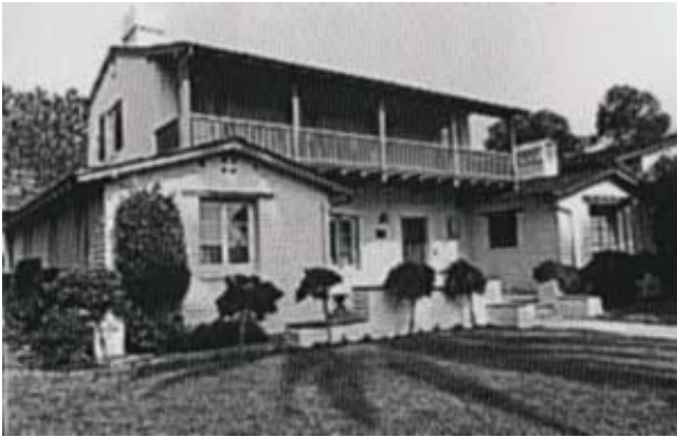
Luther Gage House Monterrey condominiums