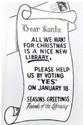
Promotional sign for the election for the library

Planning has begun to celebrate the 50th anniversary of the Carlsbad City Library and Georgina Cole building located on Carlsbad Village Drive (Previously Elm St.). By the early 1960s, it was obvious that the recently created city library system was over-crowded. Adult and Children's library services were located in separate buildings and this created a need for one large library to join collections.