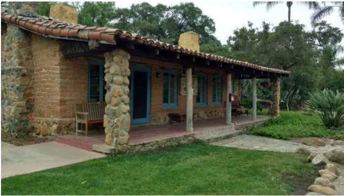
Rancho Carrillo's Caretaker House