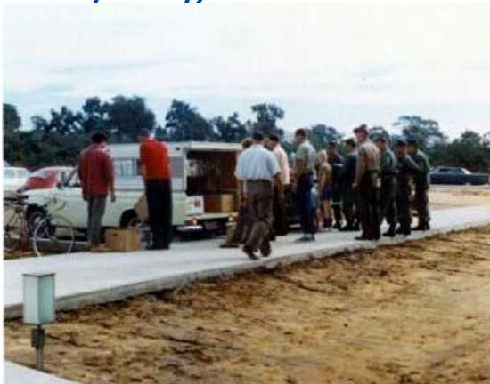
Moving into the new Carlsbad Library in 1967