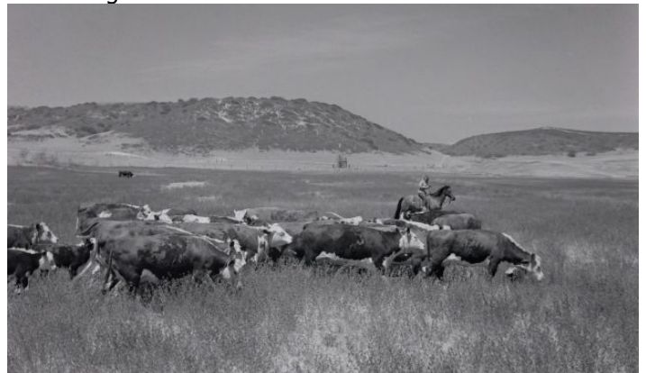
Bressi Ranch late 1940s

The Oceanside Historical Society donated to us a large box containing photo negatives taken during the 1940s and 50s from Detwiler Photo Studios. We are processing the photos, having them developed and identified and archived. Below are a few that we found particularly interesting.