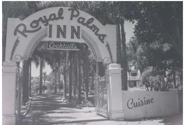
Royal Palms Inn- current site of Carlsbad Inn Beach Resort/ Norte Restaurant