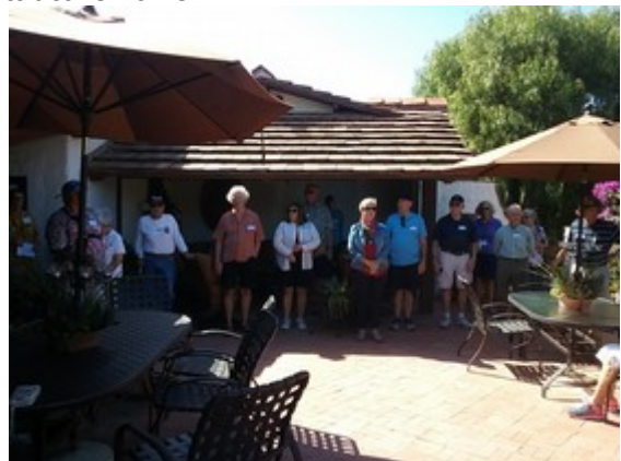
Visitors at the Marron Adobe