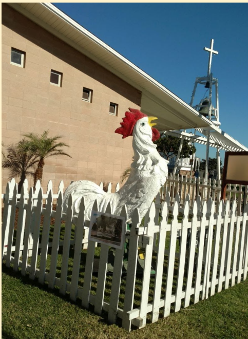
The Twin Inns Chicken visited St. Michael's

As each year passes and we enter a new year, we as a historical society are motivated to actively pursue ways and methods of preserving our local Carlsbad history. Through creation of displays, offering informative talks to the wider community, digitizing and cataloging donated papers and photographs, we are creating a research organization as well as a social group. At the end of last year the importance of these activities became apparent, when we were able to participate in the 125th Anniversary celebration of St. Michael's Church, assist researchers from many different fields pointing them to the best resources for their work, and continue with our digitization program of our own historical documents and adding them to our website. This year we'd like to continue our efforts, and hopefully return to interviewing many of our fellow members and local residents in the hopes of preserving their contributions to our town. In this newsletter, you will find articles from several of our board members detailing their efforts to our historic preservation efforts. And as the year progresses we hope to see you at some of our events.