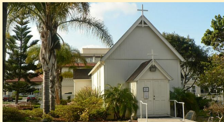
St Michael's old church