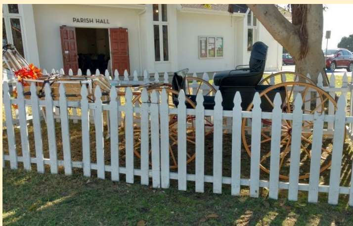
The Shipley Buggy at St. Michael's Garden

Our next goals are to begin scanning our document files and inventory files. We are open to suggestions on other documents that we should add to our website.